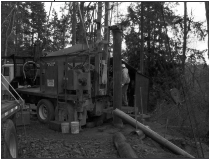
A crew has been drilling a new well to supply water to both Blaine and Birch Bay. The new well is located in the City's well field

With this procedure, the District expects no disturbance to the creek's aquatic environment. Following the environmental permitting process, the project is tentatively scheduled to begin in 2008.