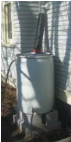
John Wiley & Carolyn Milling

garden hose, pipe or downspouts can all be used to handle overflow via the overflow valve. Overflow can be directed back down the old downspout. If allowed to flow naturally, it must flow onto a landscaped area or lawn large enough to filter the water – generally an area about 15 square feet. Overflow must be directed at least 10 feet away from any foundation or impervious surface (like a driveway or sidewalk) and 5 feet away from a neighboring property or right of way.