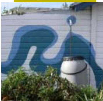
Colleen Burrows - 55 gal

For commercial rain barrel installation, follow manufacturer instructions.