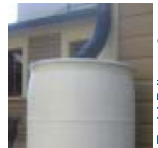
Todd Edison & Carrie Blackwood

There are a number of ways to connect the downspout to the rain barrel. Where you cut the downspout will depend on the type of connector material you choose. A flexible downspout extender makes an easy transition, eliminating the need for exact measurement because it bends and stretches. You can also use a downspout elbow, a section of straight downspout crimped on one end to fit into the hole, a rubber bib or coupling formed into a funnel shape or a chain that hangs from your gutter and drains directly into the rain barrel. Cut the downspout, then secure one connector