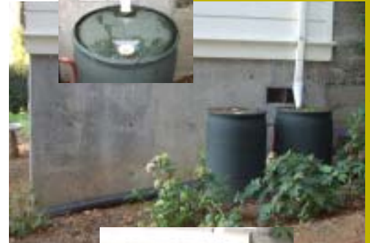
Lisa Meucci - 55 gal