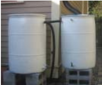
Todd Edison & Carrie Blackwood

As your rain barrel(s) fills, you will want to consider what to do with any overflow. Sections of