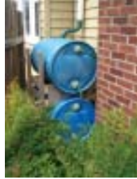
Duane Jager - 55 gal x2

Before installing rain barrels, take a moment to consider how the rain barrels will be used, how much water will be needed (especially during drier months), how many are being installed and how overflow will be handled. Also, make sure rain barrels are clean and free of debris before installing them. If the rain barrel(s) will be attached to a downspout, choose a convenient, easy-to-access location.